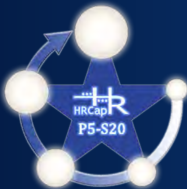
HRCAP P5-S20 RECRUITING MODEL